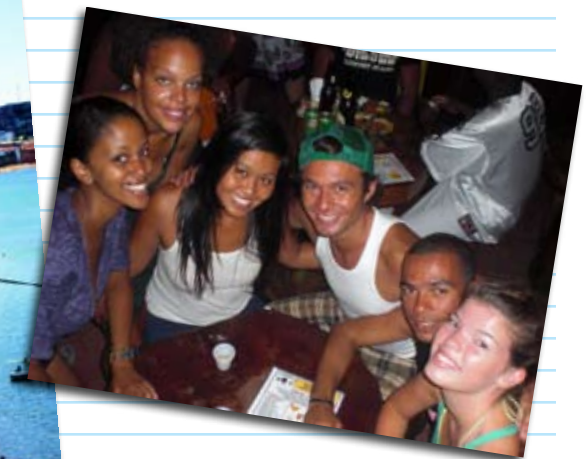
Snapshots from the students in the study abroad programme.