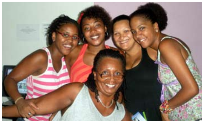
The staff of the Bahia Street Centre