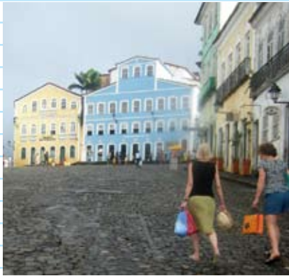
Study trip participants in Salvador